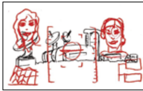
Storyboard illustrations © 2009 NSC Creative